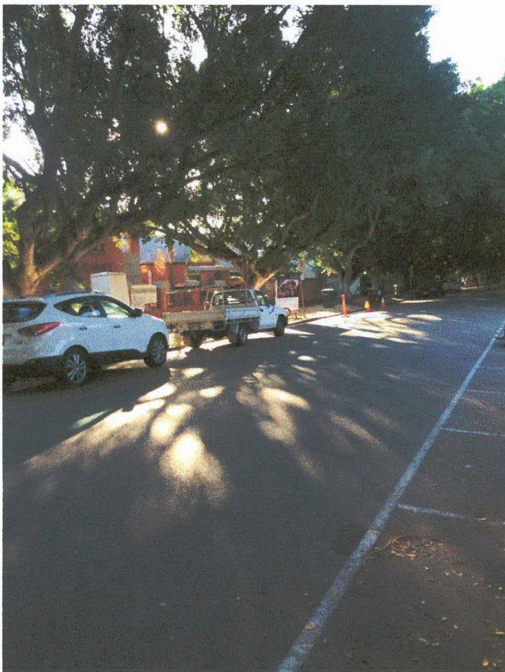
Photo taken 6.30 pm