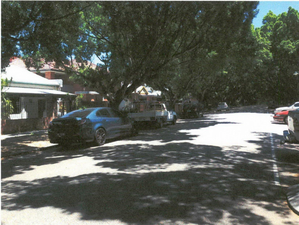
Photo taken 12 noon