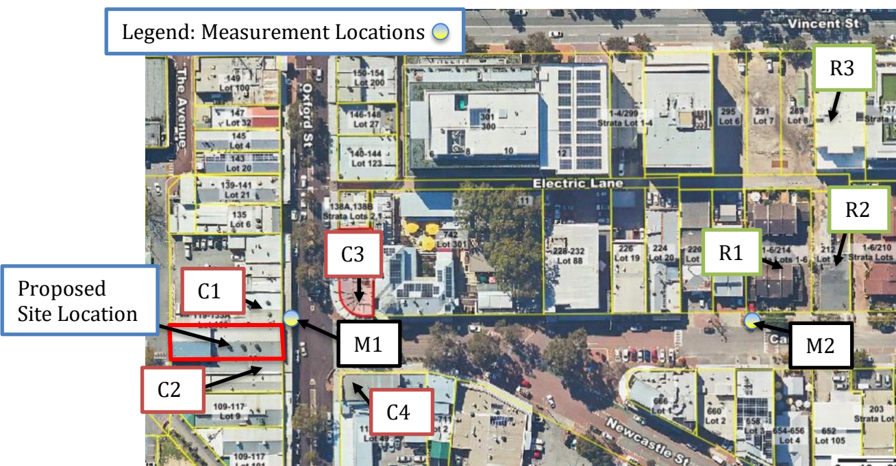
Figure 2: Proposed restaurant, nearest receivers and the ambient noise measurement locations

These locations have been chosen as representative of the nearest noise sensitive receivers. Refer to Figure 2 below for the proposed site, noise sensitive receivers and the ambient noise measurement locations.