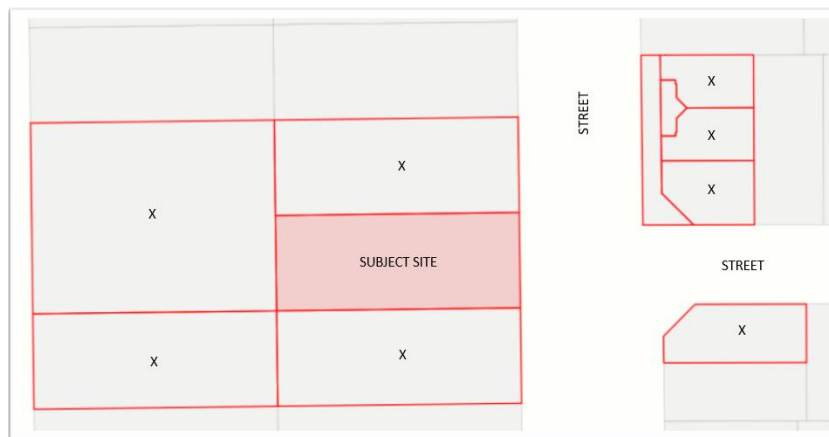
Figure 1 – Example of the extent of consultation to adjacent properties where there are varying lot layouts.