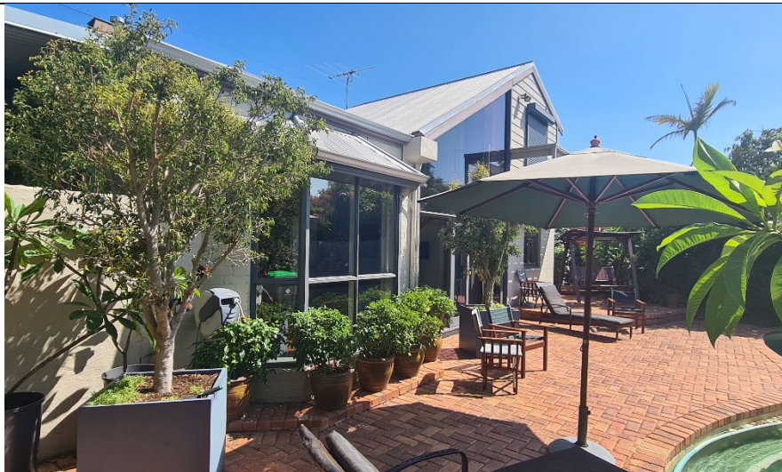
Rear two storey extension to eastern elevation