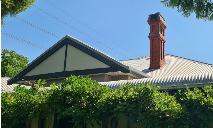
Gable and chimney to southern elevation