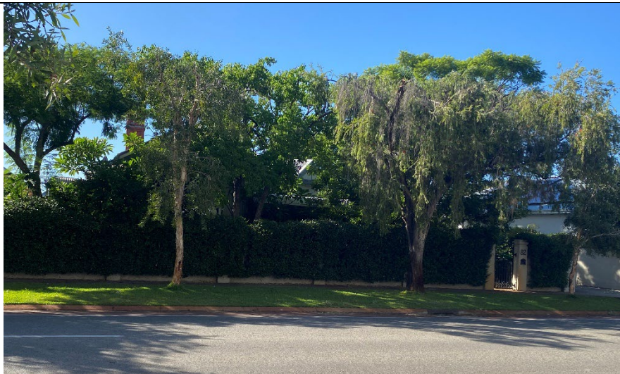
External view of western elevation from Palmerston Street