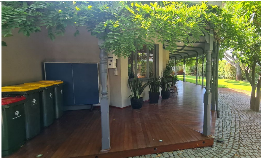
Return verandah to south west corner